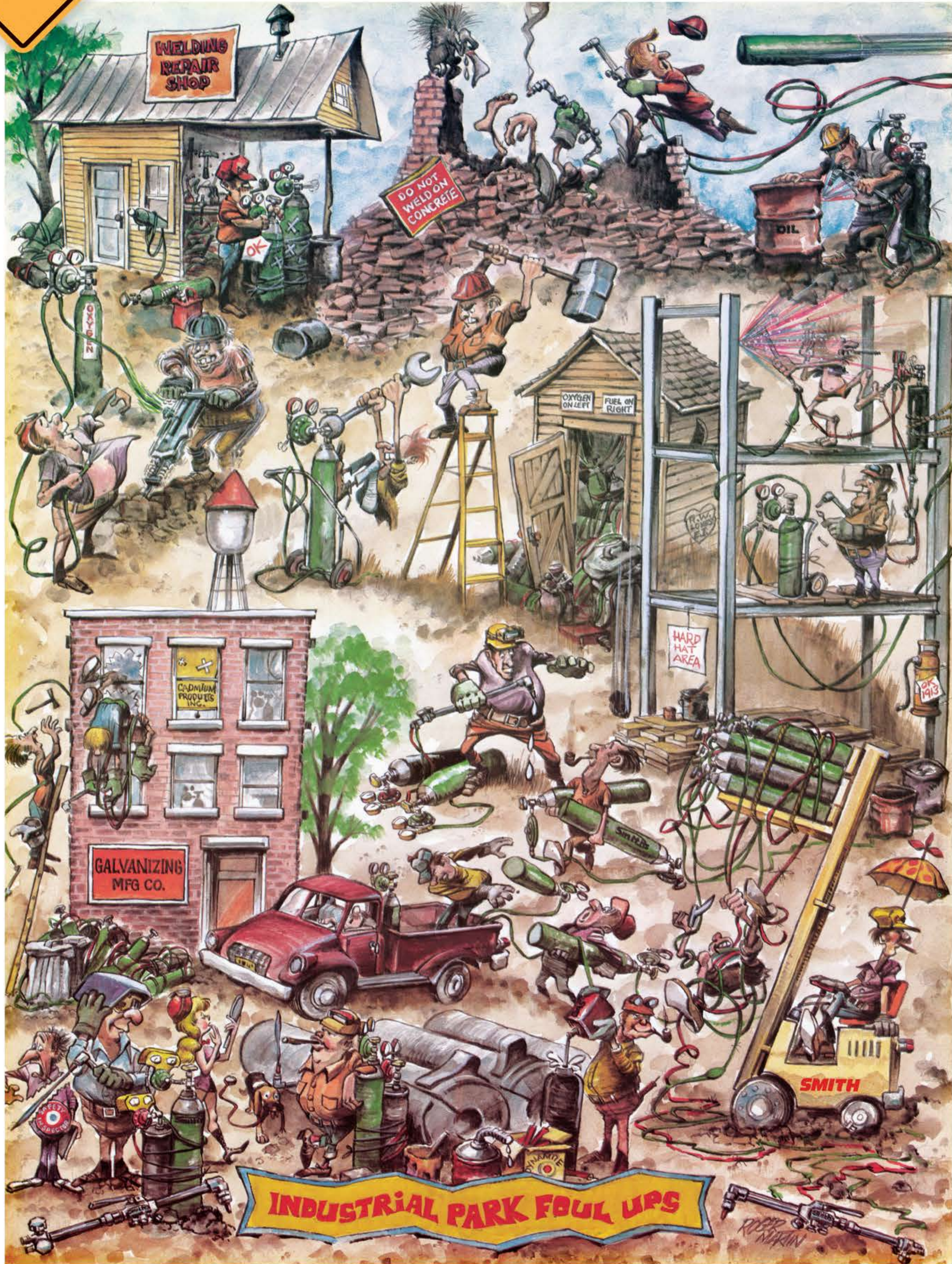
“Can you see the 37 (or more) safety violations shown here?”

Know and follow all safety rules and practices during welding, heating and cutting operations.